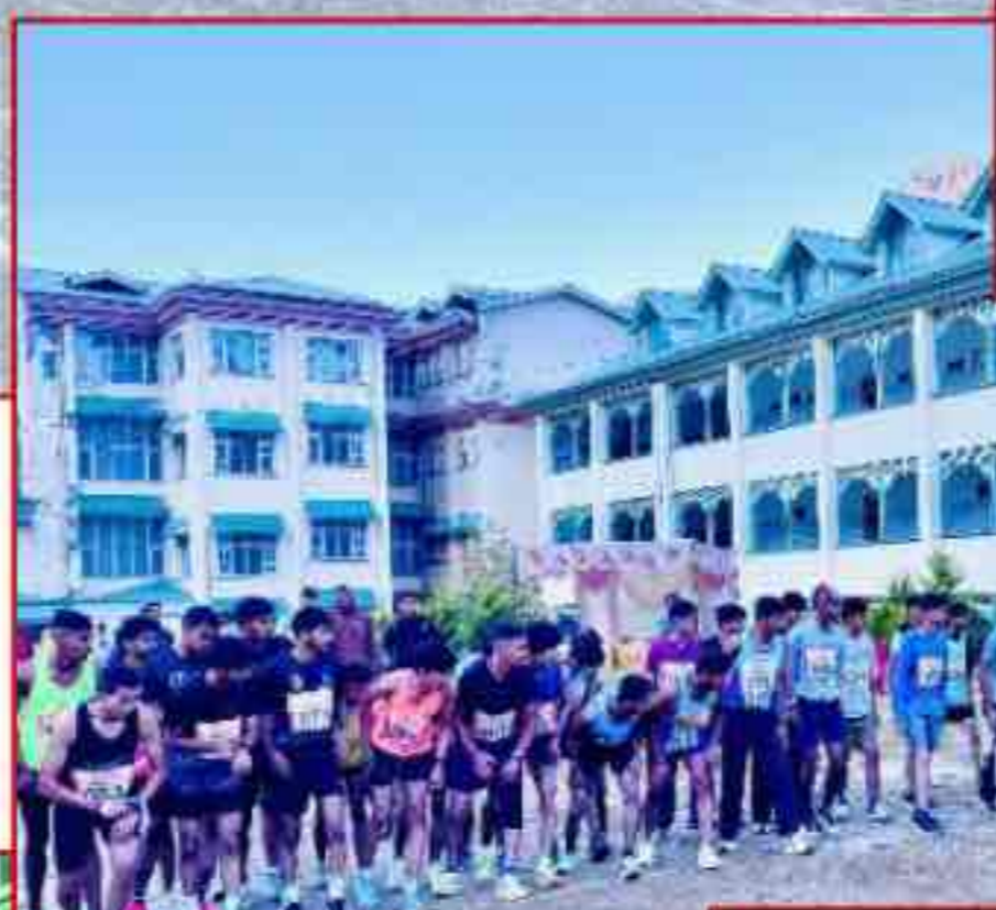
SPU Inter- College X- Counter Championship 2025.